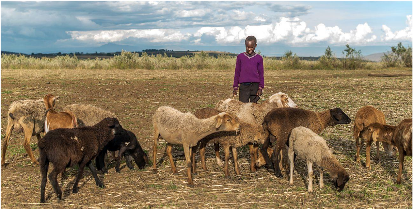
A homeless boy, Psalm 23 and Compassion

Psalm 23 is one of the most heartening psalms in times of difficulty.